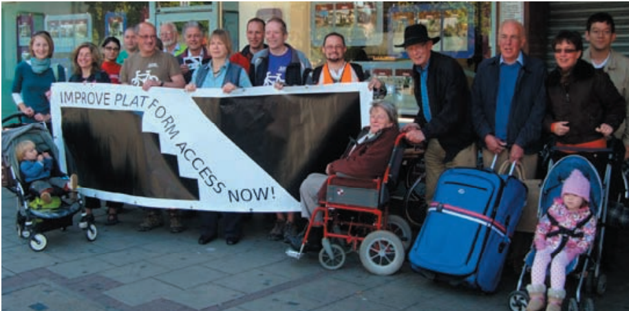
Ealing Cycling Campaign leads the campaign to improve access to Ealing Station

Our demonstration in September to publicise the need for improved station access at Ealing Broadway, was just one of the highlights in a successful year. It grabbed front page headlines in the Ealing Gazette. For several years we have been pushing the station authorities to improve facilities for the many people who find it difficult or impossible to use the steps at Ealing Broadway, and the campaign is finding growing political and cross-party support.